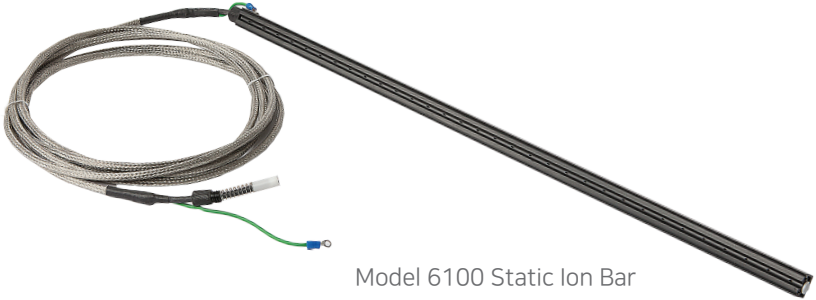
Model 6100 Static Ion Bar