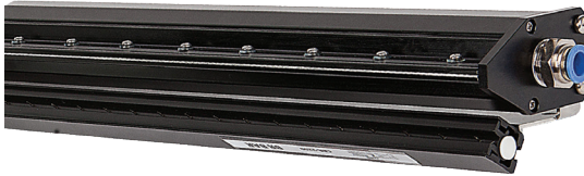
Model 6200 AirKnife Static Ion Bar